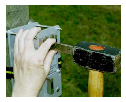
Hammering of electrodes needs some basic skills is order to avoid shifting of the tool assembly. Otherwise the electrodes will not be as parallel as they should be.

wood has been reached. Also the sound will change at that moment. Read the value on the scale and calculate the "overhang". See label on the tool upper plate.