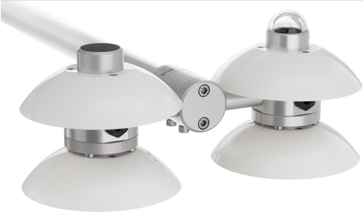
Figure 1 NR01 4-component net radiometer

NR01 is a market leading 4-component net radiation sensor, mostly used in scientific-grade energy balance and surface flux studies. It offers 4 separate measurements of global and reflected solar and downwelling and upwelling longwave radiation, using 2 sensors facing up and 2 facing down. NR01 owes its popularity to its excellent price / performance ratio. Advantages include its modular design with 2 pairs of identical sensors, low weight, ease of levelling, and low solar offsets in the longwave measurement. The unique capability to heat the pyrometers reduces measurement errors caused by dew deposition.