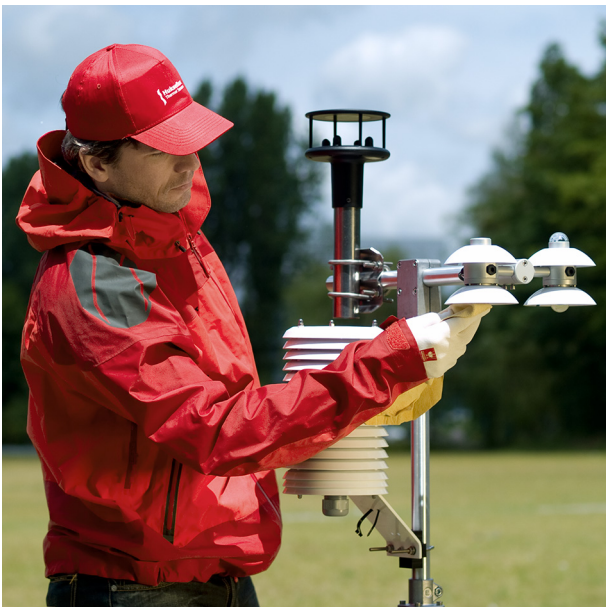
Figure 2 NR01 in use in a typical meteorological station