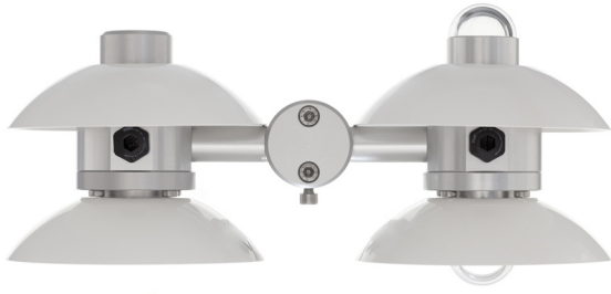
Figure 4 NR01 4-component net radiometer, including two pyranometers, two pyrgeometers, heater and 2-axis levelling assembly (mounting tube not included)