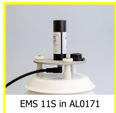
EMS 11S in AL0171